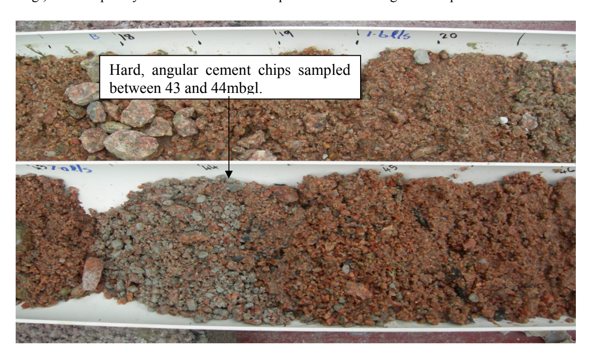
Figure 3. Rock chip samples collected every 0.5m during drilling at La Rocque.

Rock chip samples were sampled and documented every half meter depth. The presence of hard cement chips collected from the depth interval between 43 and 44 mbgl (immediately below the base of the grout) is seen in Figure 3. This shows unequivocally that the base of the grouted upper section of the borehole (to 43 mbgl) had completely hardened and that no liquid or unhardened grout was present in the borehole.