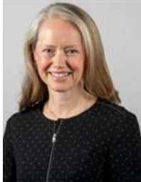
Senator Kristina Moore

The Senator resigned from the Panel in October 2019 but was involved with the early stages of the review.