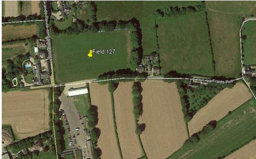
FIELD 127, La Grande Route de St. Laurent / La Fraide Rue, St. Lawrence

Field 127 provides opportunity to create a new Domestic Dwelling area similar to others around the Island contained within a defined area to create an area of residential development with complimentary features to existing domestic and institutional properties surrounding the site. The field, at the moment, is rented out to Jersey Royal Potato Company.