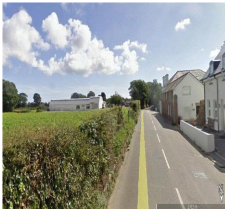
Commercial buildings to the South and residential to the West of Field No 127