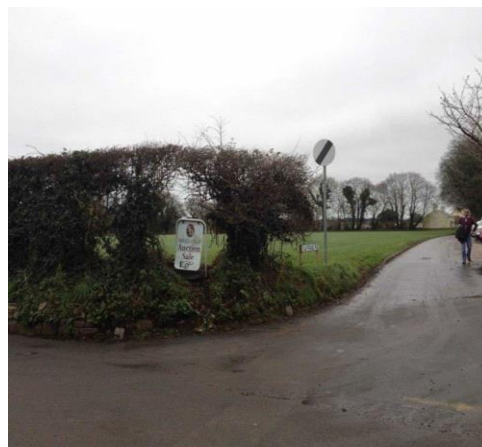
Entrance to La Fraide Rue from La Grande Route de St Laurent