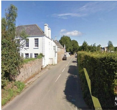
North bound La Grande Route de St. Laurent, field No 127 to the right