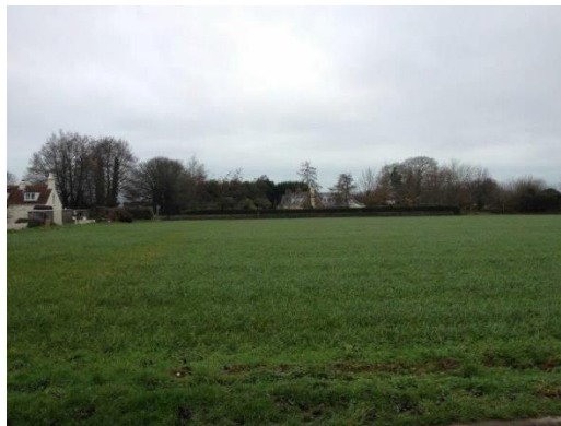
View to the North from entrance into La Fraide Rue