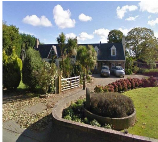
Residential buildings to the North of field No 127