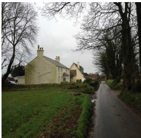
Residential buildings East of Field No 127