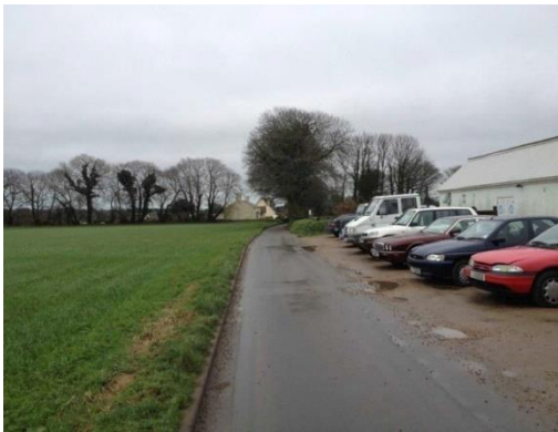
View to the East down La Fraide Rue