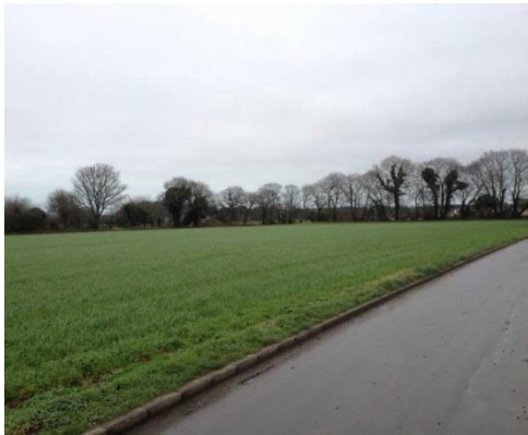
View to the East from entrance into La Fraide Rue