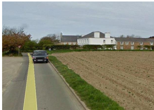
View to La Grande Route de St Laurent from La Fraide Rue