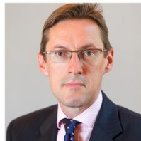
Senator Ian Gorst Minister for External Relations