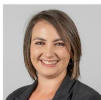
Senator Tracey Vallois Minister for Education