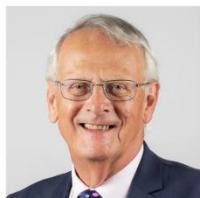
Connétable Len Norman Minister for Home Affairs