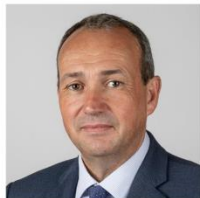
Senator Lyndon Farnham Deputy Chief Minister, Minister for Economic Development, Tourism, Sport and Culture