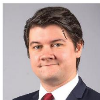
Senator Sam Mézec Minister for Children and Housing