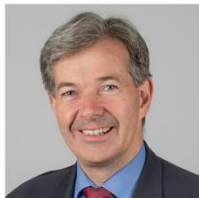
Senator John Le Fondré Chief Minister