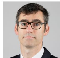
Deputy Montfort Tadier Assistant Minister for Economic Development, Tourism, Sport and Culture