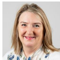
Deputy Judy Martin Minister for Social Security