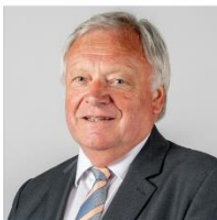
Deputy Hugh Raymond Assistant Minister for Health and Social Services, Assistant Minister for Infrastructure