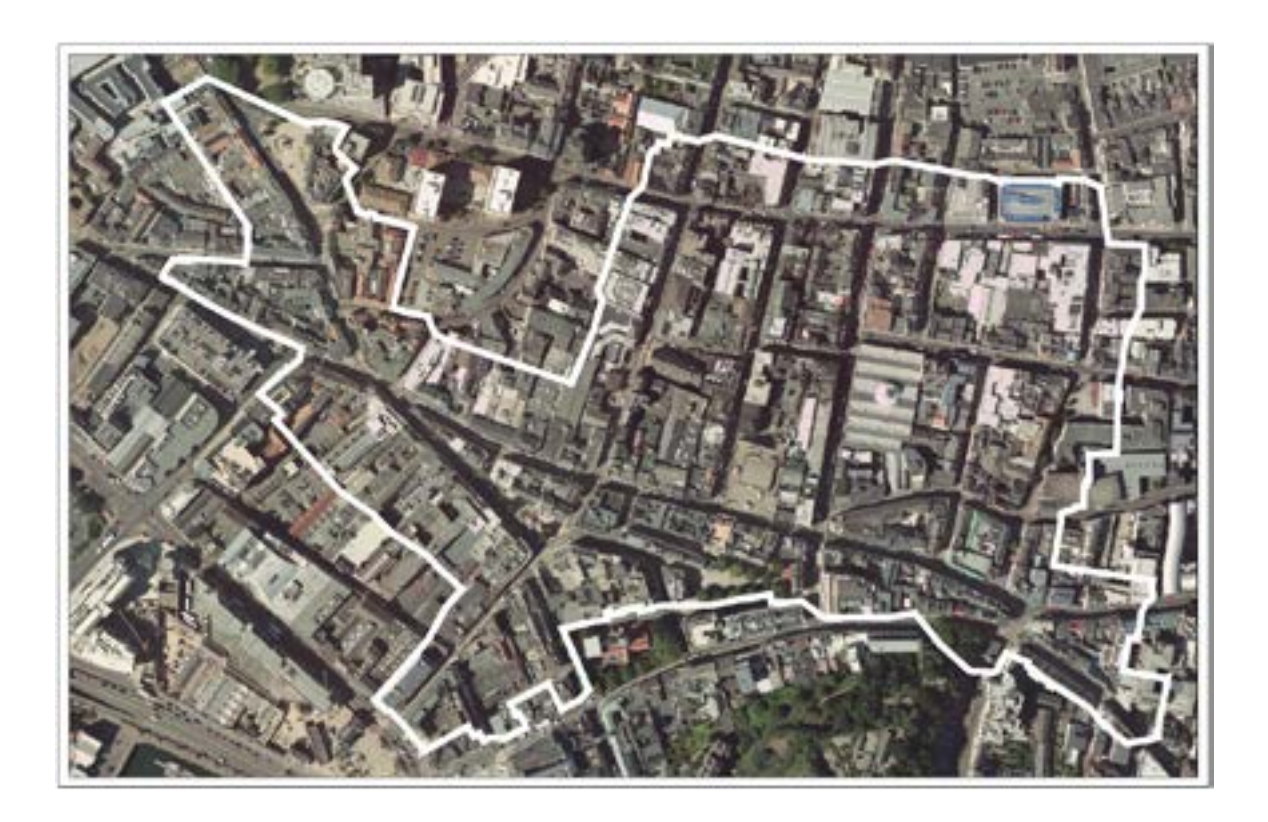
Fig 3: Map of St Helier Core Retail Area