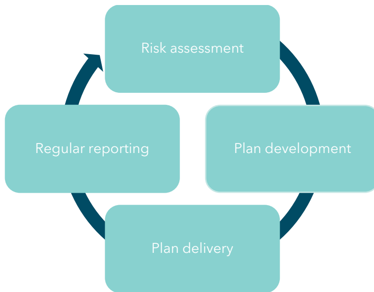
Exhibit 3: The Audit Planning Cycle