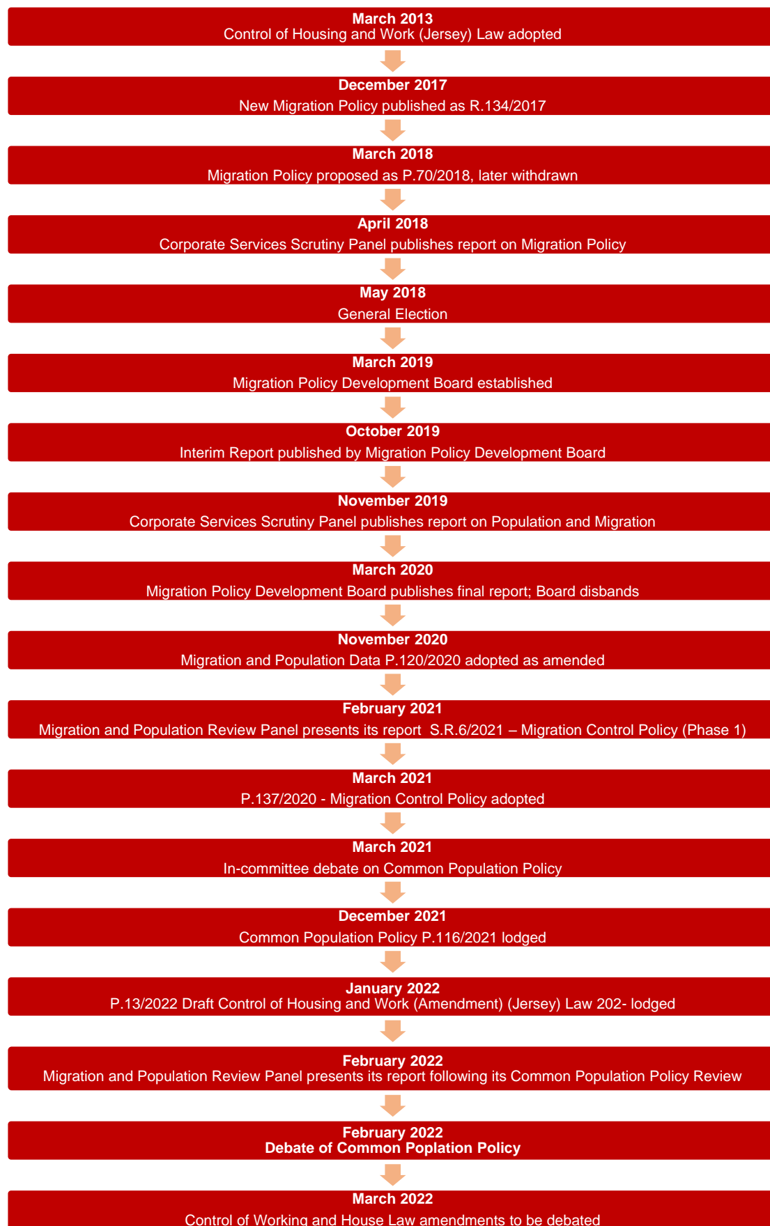
Figure 1 – Timeline to P.116/2021 Common Population Policy